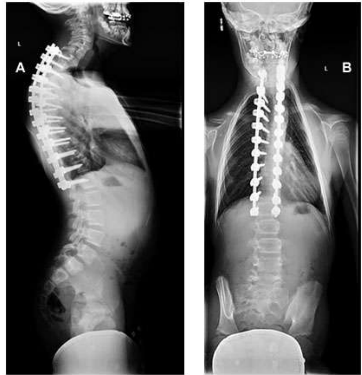
X-rays of Jordan's spine almost a year after surgery showing well corrected scoliosis curves and a stabilized kyphosis curve.

This case is significant because while there was no perfect solution for dealing with the presence of multiple hemivertebrae an adequate solution made it possible for Jordan to continue participating in the normal activities of an active adolescent.