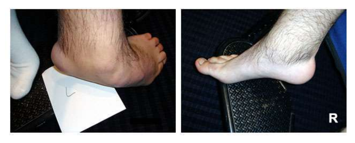
Vincenzo's feet showing equinovalgus deformities.