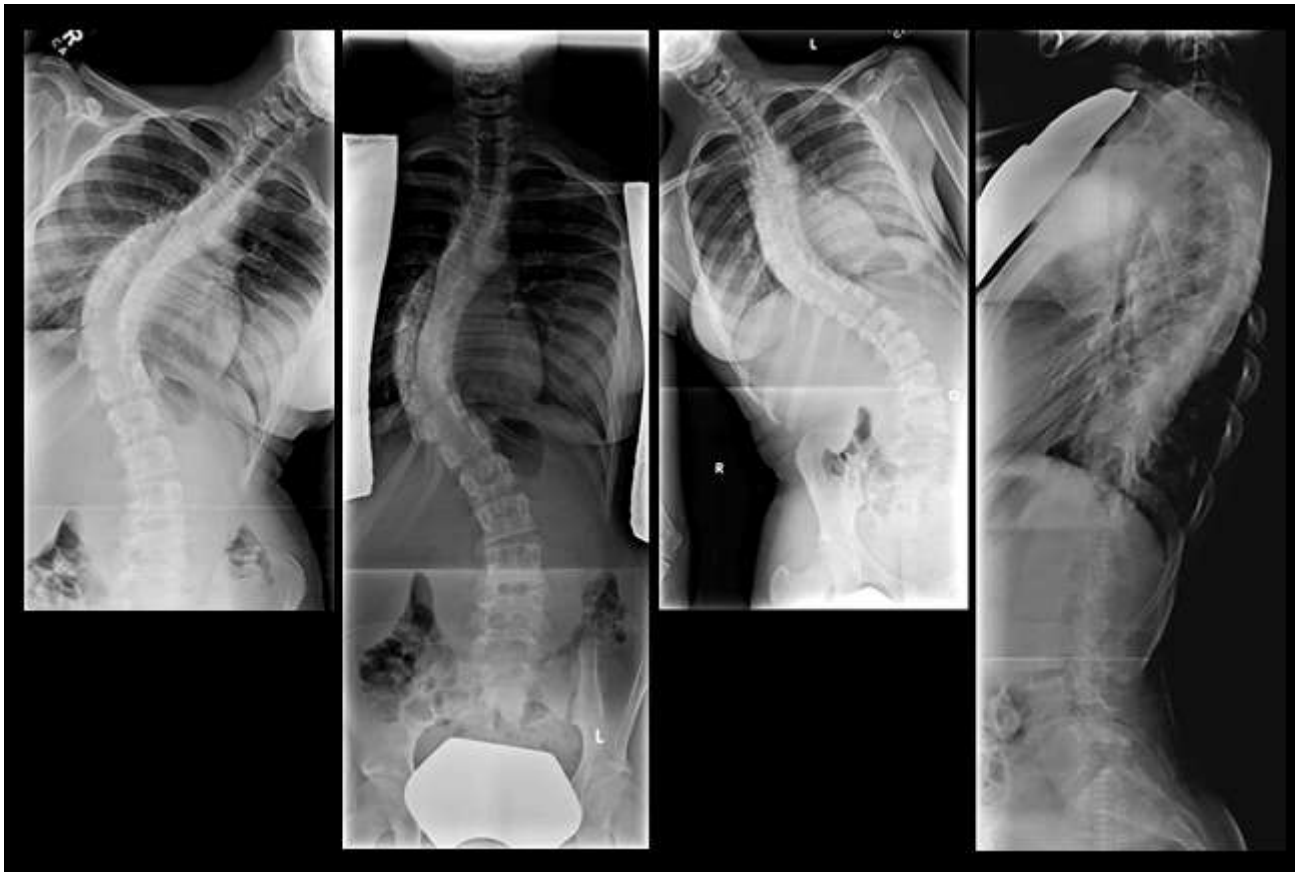
Pre-op x-rays of Stephanie's spine showing severe scoliosis in the thoracic vertebrae.